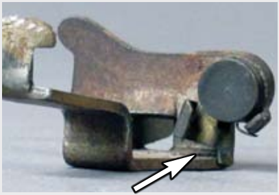
Brass spring retainer

Left, Type 2 latch coupler, 1925–27 with arrow pointing to the brass spring retainer. Right, Type 2s (slot) latch coupler with brass spring retainer and arrow pointing to added slot for a hook coupler. Type 2 had five parts to assemble, and the brass spring retainer was easily damaged by rough handling. Lionel engineers soon developed a solution.