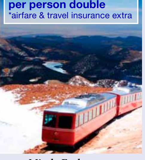
9 Days • 12 Meals: 8 Breakfasts, 4 Dinners

For more information visit: https://gateway.gocollette.com/link/832990