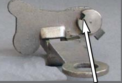
Notch to retain spring

Left, Type 3 latch coupler, 1928-42 with notch in rivet to retain spring. Right, Type 3s (slot) latch coupler, 1928-32 with notch in rivet to retain spring and slot for hook coupler. This improvement had four parts to assemble and was resistant to damage from rough handling.