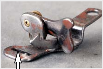
Slot for hook coupler

Left, Type 3 latch coupler, 1928-42 with notch in rivet to retain spring. Right, Type 3s (slot) latch coupler, 1928-32 with notch in rivet to retain spring and slot for hook coupler. This improvement had four parts to assemble and was resistant to damage from rough handling.